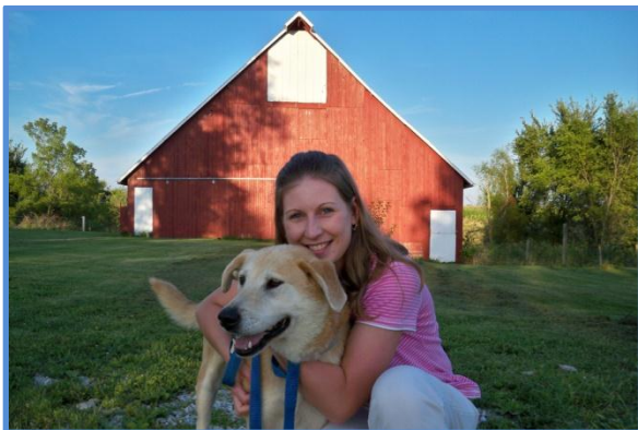
Pictured: A TOML Foundation Beneficiary