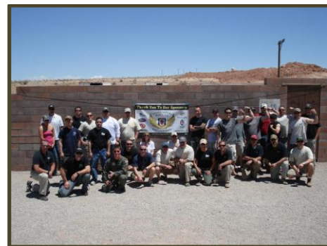
Pictured: Nellis 3-Gun Shoot Attendees