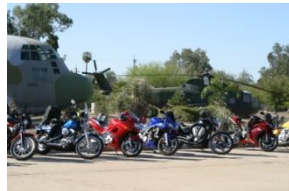
Angel Thunder Poker Run