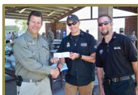
Nellis Appreciation BBQ

The very successful operations event calendar, where various charity events were held in the thirteen areas adjacent to our USAF Rescue Warrior locations brought in revenues that approached $60,000. This very solvent financial situation not only allowed many of our constituency to directly support the Foundation in furthering its charity efforts, but used our best business asset, Rescue Warriors, to speak for the Foundation. Table 3 displays the revenues and costs in several support events: